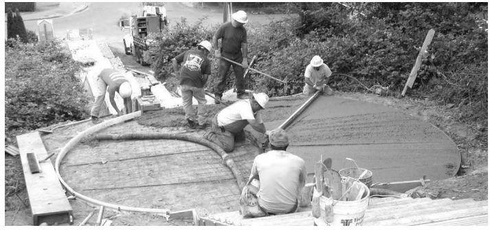
Seattle Dept. of Transportation crew pouring the Hillclimb stairway landing. After the landing was poured, they stamped a pattern of raindrops and cherry blossoms.

Again, FCH invites your participation in the Hillclimb project. Your cash, in-kind, and labor donations are crucial for completing this project. And we always welcome your help at the monthly maintenance parties (4th Saturdays, 10:00-12:00, March through October). Email us at info@charlestownhillclimb.org for information or to be added to our email list. You can also find more information about the Hillclimb on our Web site: www.charlestownhillclimb.org.